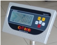
GMS3119P-B (LCD display with Backlight)