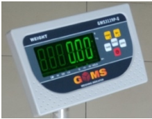
GMS3119P-G (Green LED display)